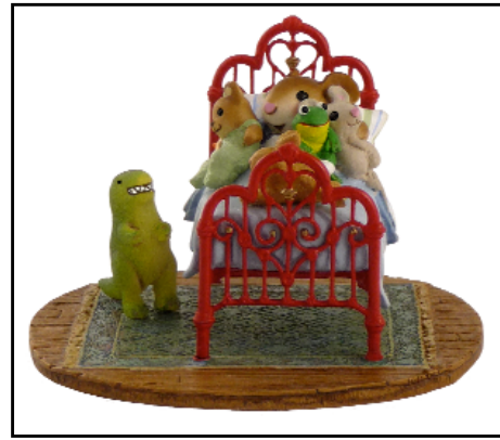
retail price: $210.00 M-412b His Creature Comforts

This piece is available as pictured or can be made more personal and fun! The collector can customize their own by choosing the stuffed animals (pictured below) on and around the bed. The stuffed bear, chick and mouse are the same on each piece and cannot be changed. To customize please see the Creature Comforts order form below.