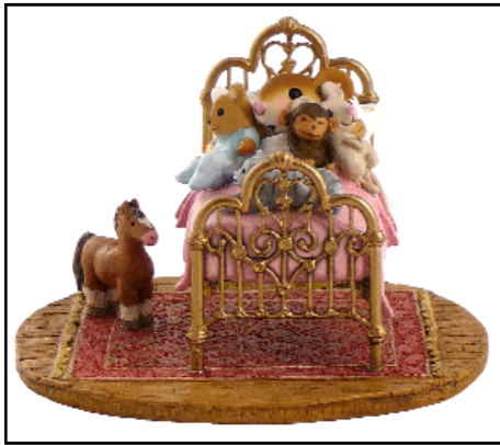
M-412a Her Creature Comforts

Wee Forest Folk introduces these sculptures of a boy or girl mouse snuggled in bed and surrounded by their favorite stuffed animals!